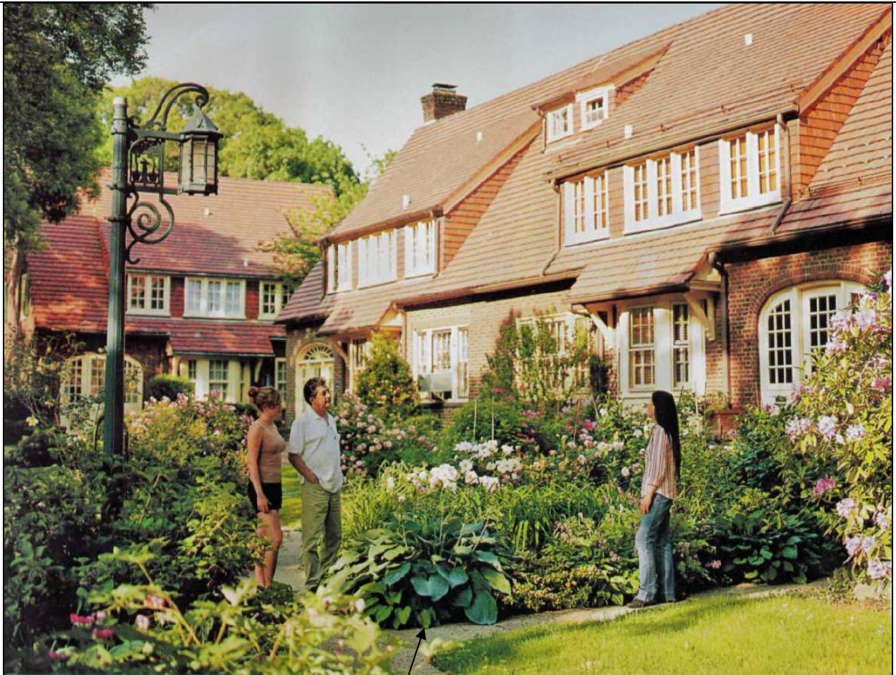
Pedestrian and neighborhood friendly with heavy landscape and foliage.