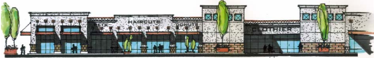
PARTIAL (split and angled) ELEVATION VIEWED FROM STATE HIGHWAY 78