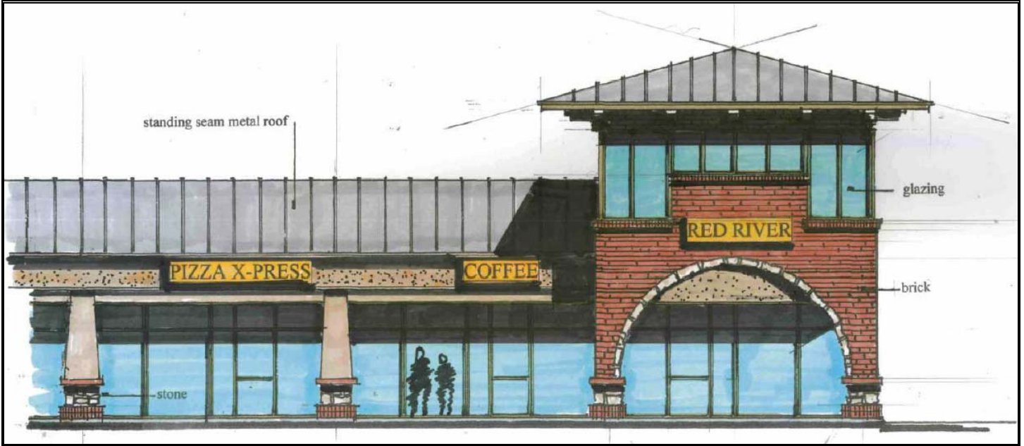
PARTIAL PROPOSED CORNER ELEVATION

please see the back side for additional information